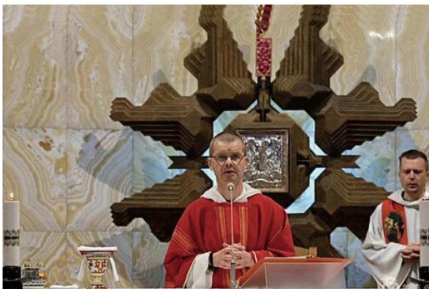
House of Worship